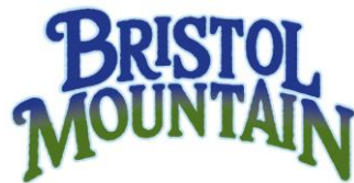
Photo Upload Guide

After you select Upload Photo on the GUEST DETAILS page you will be directed to the GUEST PHOTO UPLOAD page. Select Choose File and select a photo from your computer that you would like to use for your Snowsports Club Pass.